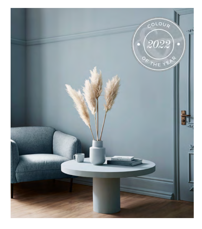
Most\ Popular\ Paint \mathbf{breathe}

When it comes to blinds our Yasuni Lush design takes the crown for both romans and rollers. For murals, our Botanique Jungle Dawn design wins not only for our customers but also for the press with it gaining the most features all of our mural designs.