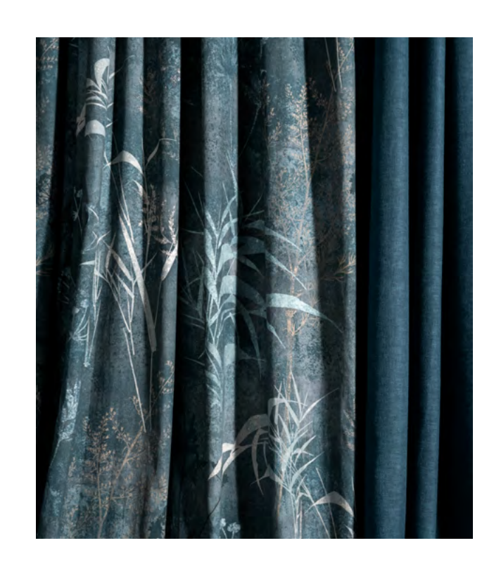
Most Popular Curtains RESTORE MIDNIGHT