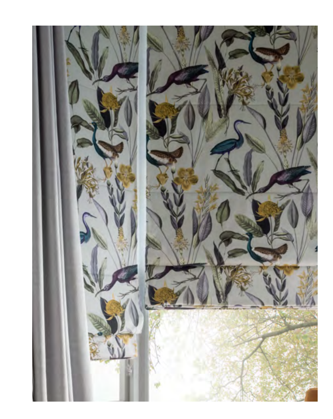
Fabric {\tt Glasshouse} \ {\tt Soft} \ {\tt Grey}