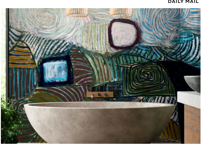
HERBERT EXTERIOR EGGSHELL EVENING STANDARD PASMORE SPIRAL MOTIF MURAL RESIDENCE.NL